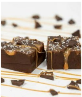
Dark Chocolate Caramel Sea Salt Fudge $12.00