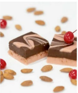
Amaretto Chocolate Fudge $12.00