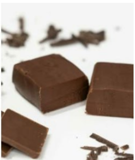
Chocolate Fudge $12.00

USE THIS QR CODE TO TAKE YOU RIGHT TO THE WEBSITE FOR ORDERING