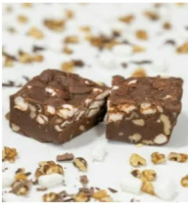
Rocky Road Fudge $12.00

We thank you for your support of this fundraiser.