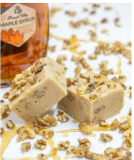
Maple Walnut Fudge $12.00