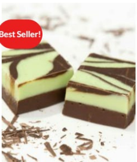
Mint Chocolate Swirl Fudge $12.00