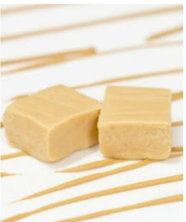
Peanut Butter Fudge $12.00