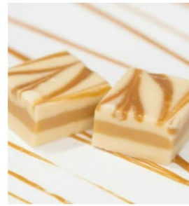
Caramel Vanilla Swirl Fudge $12.00