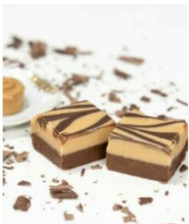
Peanut Butter Chocolate Fudge $12.00