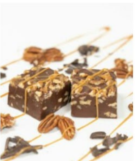
Chocolate Pecan Turtle Fudge $12.00