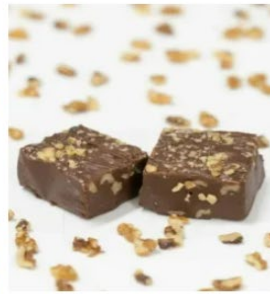
Chocolate Walnut Fudge $12.00