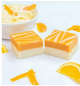
Orange Cream Fudge $12.00